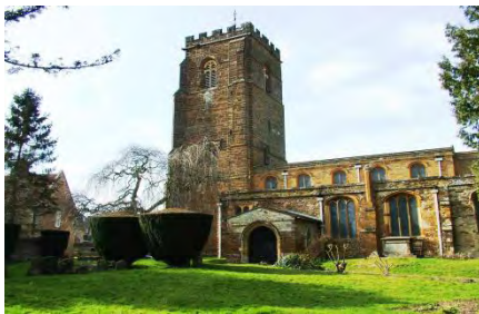
St Lawrence, Towcester