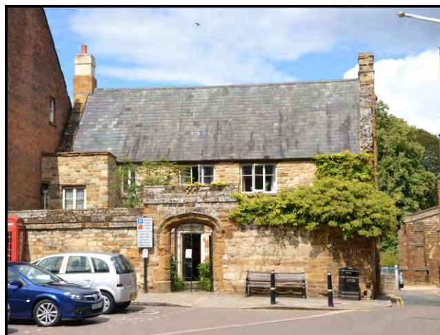
The Chantry House