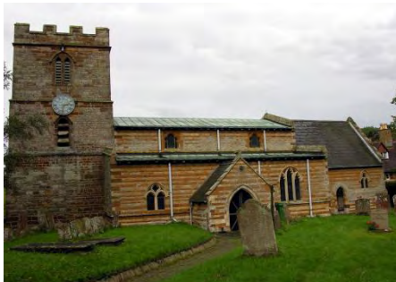
St Michael, Bradden