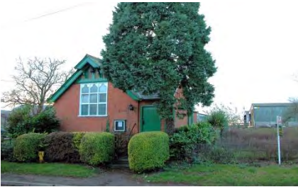
St Augustine, Caldecote