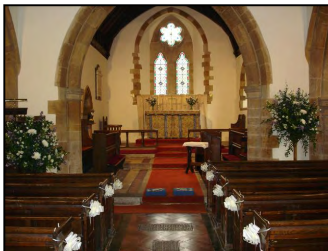
St Michael's Church, Bradden