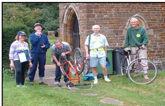
Stride and Ride

Greens Norton is one of the liveliest villages in the Towcester locality. In addition to the Church it has a Methodist Chapel, a pre-school playgroup, two nursery schools, a Church of England Primary School and benefits from a large number of activities and clubs run by villagers. These include The 50+ Club, British Legion, Cricket Club, WI, an Art and Craft group, Guides, Brownies and Cubs. There is also a playing field, a substantial "pocket" wildlife park, a village hall and a community centre.