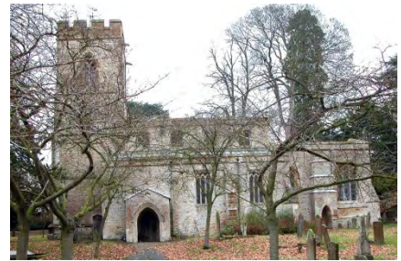
St Mary, Easton Neston