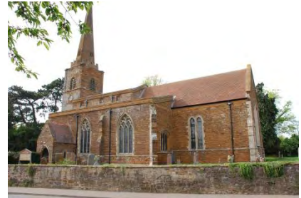
St Bartholomew, Greens Norton